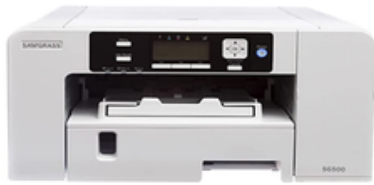
Dye Sub Printer