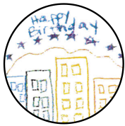
(sample button) Actual button size: 1"